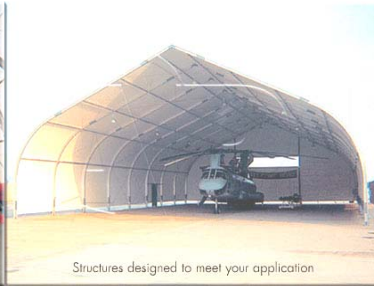
Structures designed to meet your application